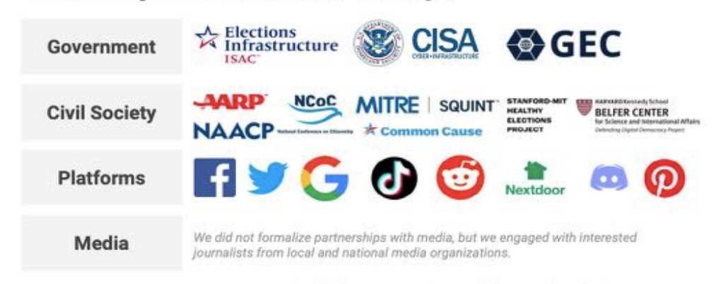
Figure 1.3: Major stakeholder groups that collaborated with the EIP.

111. "In this election cycle, the EI-ISAC served as a singular conduit for election officials to report false or misleading information to platforms. By serving as a one-stop reporting interface, the EI-ISAC allowed election officials to focus on detecting and