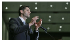
Ryan Seeks to Merge Poverty Programs