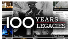
Interactive: The Lasting Impact of World War I