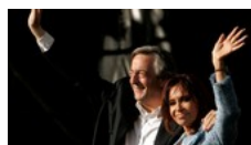
Money, Politics Stir Argentine Intrigue