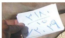
10,000 Bodies: Inside Assad's Crackdown