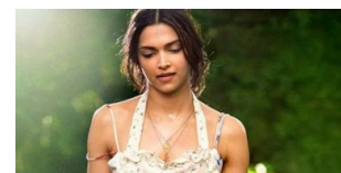
'I am a virgin' says Deepika Padukone Cens...