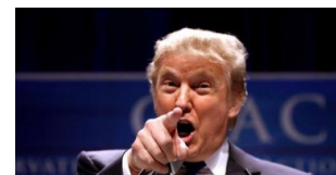
Donald Trump: I ha Indians, Muslims,