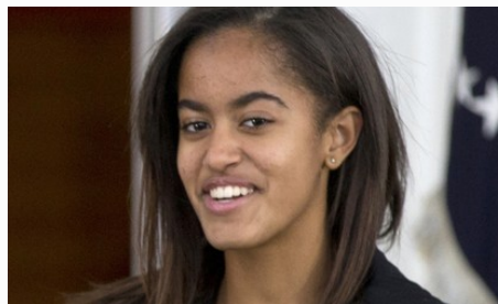
Malia Obama's IQ Will Make You Laugh out Loud