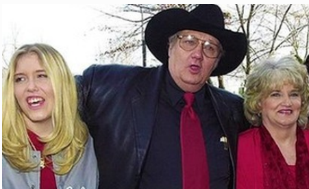
14 Time Lotto Winner: Do This Every Time You Buy A Lotto Ticket (Win 1/12 Times)