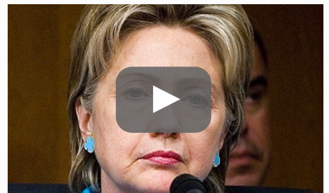
Hillary's Massive Post-Election Meltdown Caught on Video