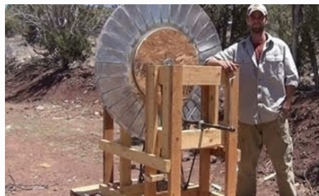
12x More Efficient Than Solar Panels? Scientists Screaming in Disbelief (watch)