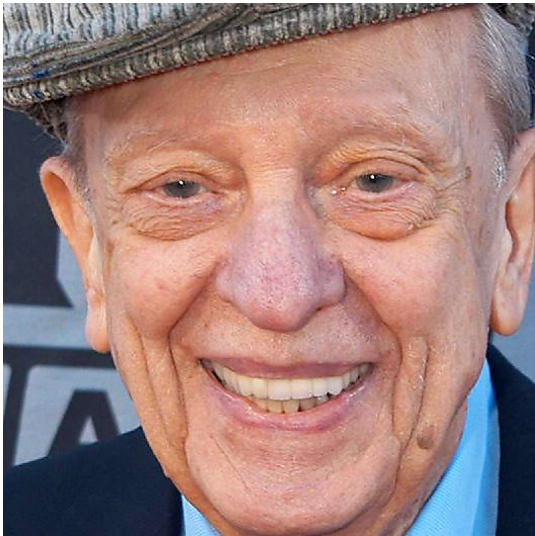
Fans Stunned As Don Knotts Blurts Out Why He Left 'The Andy Griffith Show'