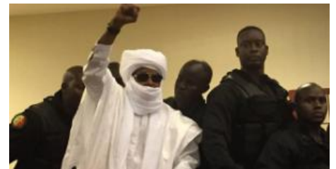
Former African Dictator Habré Sentenced to Life Imprisonment