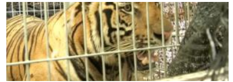
Tigers seized from Thai temple

He was also director of a new initiative at MIT back in 2012. But after the Gizmodo coverage, his complaint stated,