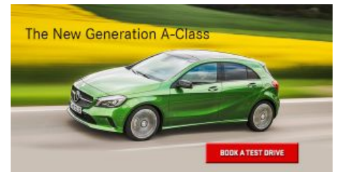
The New Generation A-Class