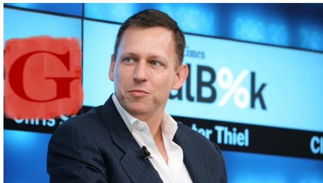
Peter Thiel vs Gawker Pits Journalists Against Silicon Valley

The gossip empire Gawker Media made a formidable enemy when it outed a tech billionaire as gay in a 2007 article called “Peter Thiel is totally gay, people.”