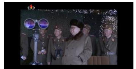
North Korea missile launch attempt fails, South Korea says