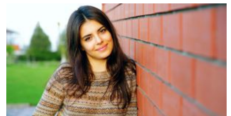
Finding love is hard!