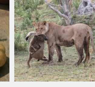
A Lioness Captures A Baby Baboon And Does The Last Thing Fuzzfix