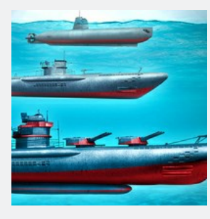
Pirates: Finally a Free and Addictive Strategy Game! Plarium