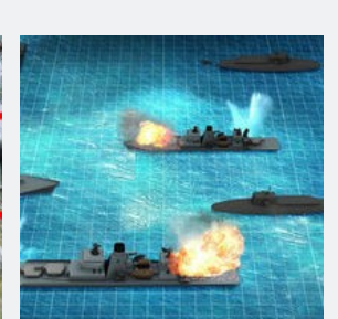
Pirates: The Strategy Game Phenomenon of 2015 Plarium