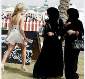
20 Dubai Photos That Would Only Happen Here Pixte