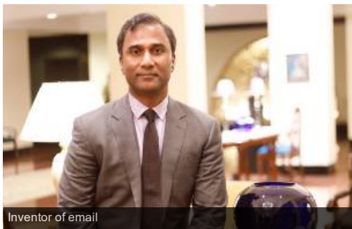
Inventor of email

The young inventor, who hails from Mumbai, is an engineer, entrepreneur, and a writer.