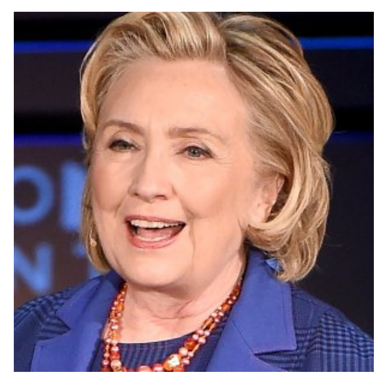
Hillary's Apparent Wandering Eye Revealed in Surprising Tell-All