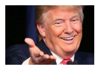
Hate crime rampant in US, Donald Trump top keyword associated with incidents of hate

Unlike what few organizations who claim to represent Indian Americans — I question they represent