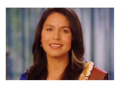
Congresswoman Tulsi Gabbard sends uplifting message in celebration of Sri Krishna Janmashtami