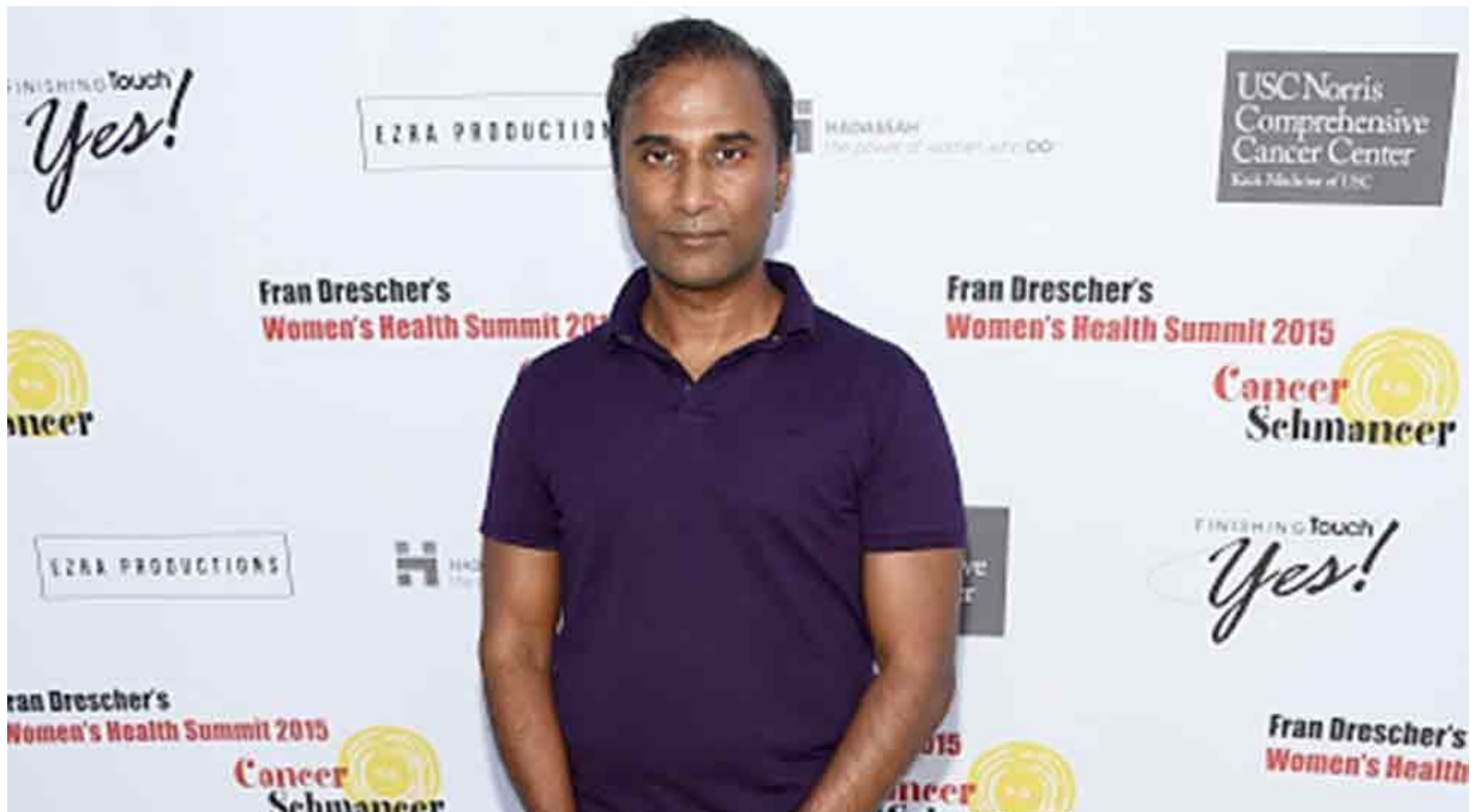
Shiva Ayyadurai

S hiva Ayyadurai, an Indian-American scientist and inventor of electronic mail system, filed a $35million defamation case against Gawker Media LLC at a US court on Tuesday.